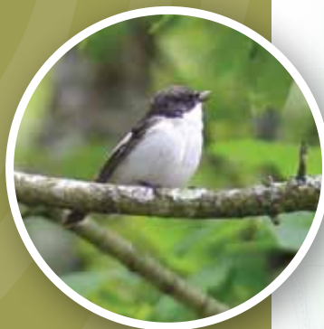
Gwybedog Pied Flycatcher

F Tanws a Melin Werngron - lle prysur iawn yn yr amser a fu, tanws i drin crwyn defaid a melin yd, roedd y ddau yn gwasanaethu ucheldir Cwm Bychan.